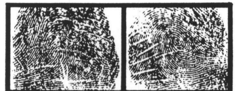
LEFT THUMB PRINT RIGHT THUMB PRINT

WANTED FOR: CRIMINAL CONTEMPT OF COURT Warrant Issued: District of New Jersey Warrant Number: 9050-0228-0111-F DATE WARRANT ISSUED: February 27, 1990